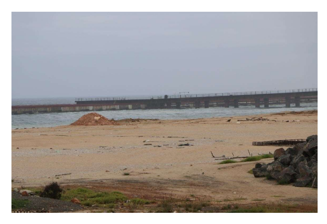
Plate-1: HTL at Vizhinjam Port (Location: 76° 59' 46.60" E 8° 22' 23.13" N, Thiruvananthapuram Municipal Corporation, Village: Vizhinjam)