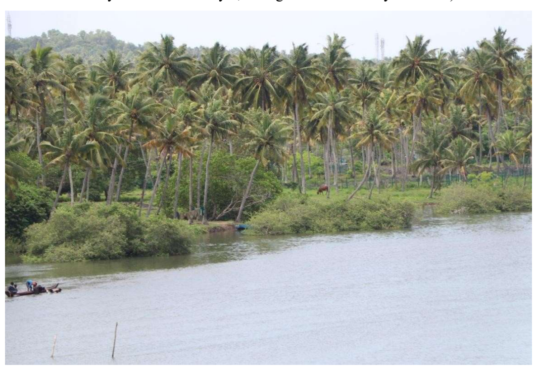
Plate-8: Mangrove patch at Madanvila Kayal. (Location: 76° 47' 51.92" E 8° 38' 9.57" N, Azhoor Panchayat, Village: Azhoor)