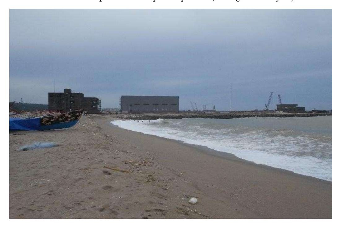
Plate-2: HTL at Vizhinjam beach (Location: 76° 59' 23.04" E 8°22' 42.32" N, Thiruvananthapuram Municipal Corporation, Village: Vizhinjam)