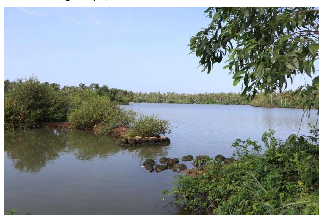
Plate-6: Mangrove area in Anchuthengue Kayal (Location: 76° 44' 51.81" E 8° 41' 31.96" N, Vakkom Panchayat, Village: Vakkom)