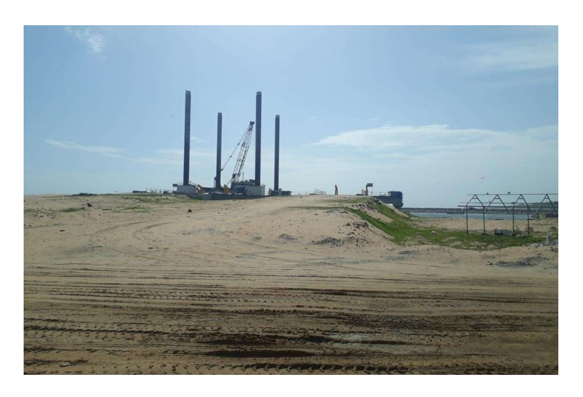
Plate-7: HTL at Perumathura harbour (Location: 76° 47' 14.99" E 8° 37' 55.06"N Chirayinkeezhu Panchayat, Village: Sarkara-Chirayinkeezhu)