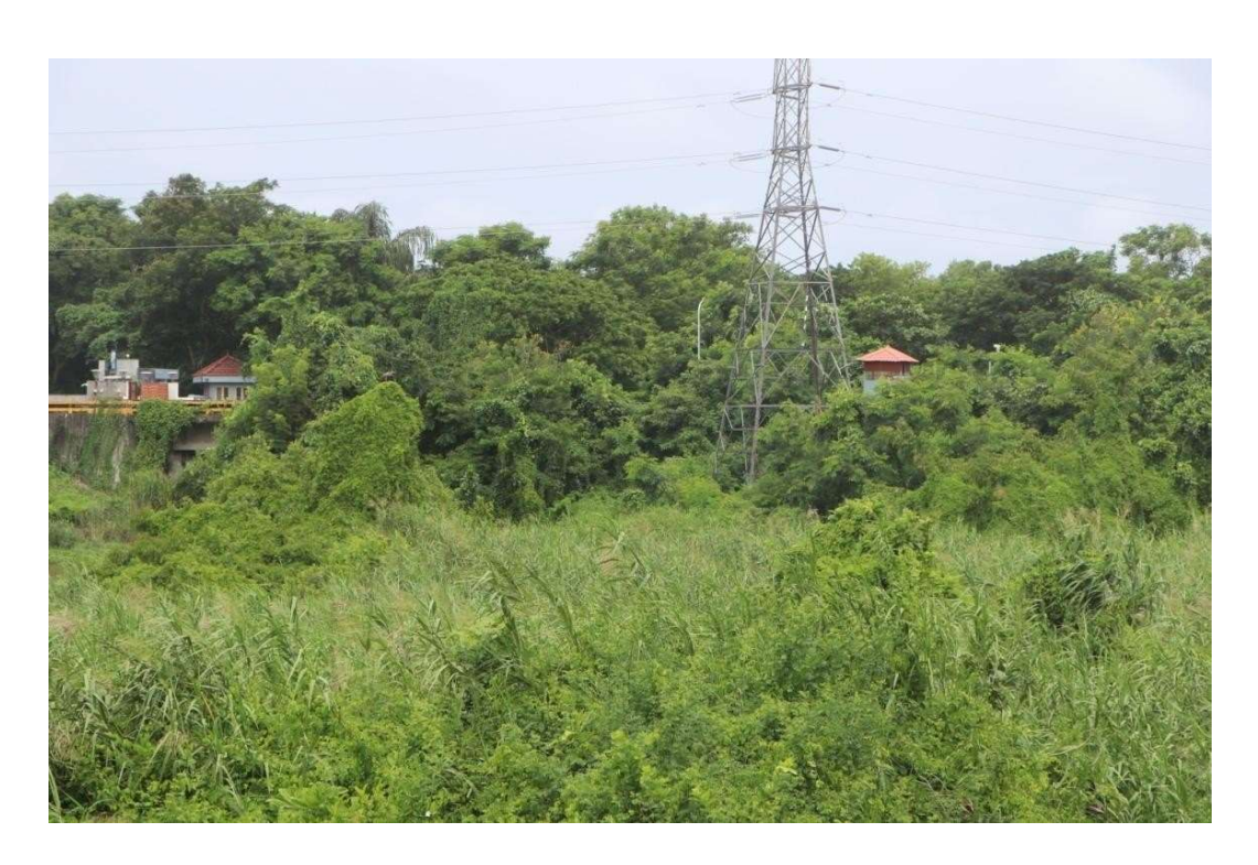
Plate-5: Mangrove's missing near Veli Railway bridge (Location: 76° 53' 19.73" E 8° 30' 48.14" N Thiruvananthapuram Municipal Corporation, Village: Attipra)