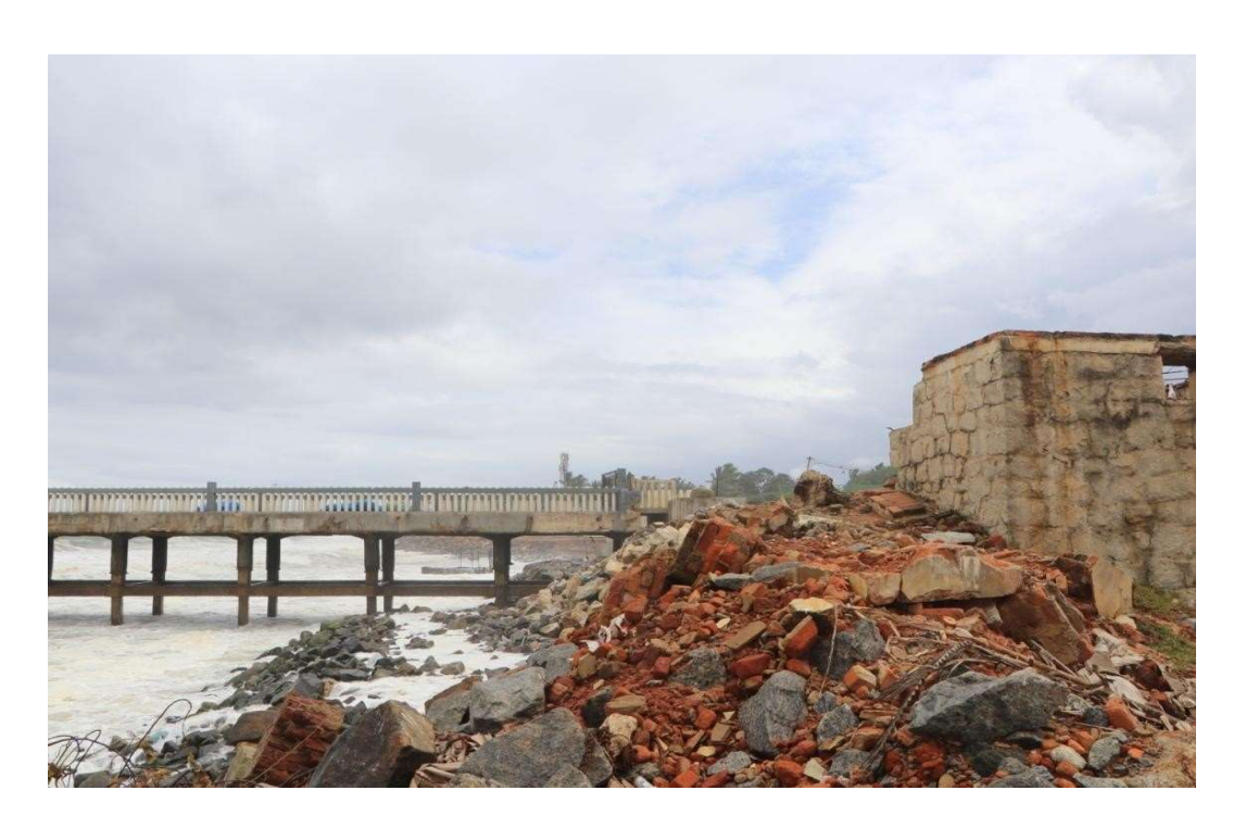
Plate-3: HTL at Valiyathura beach, (Location: 76° 55' 27.48" E 8° 27'52.69" N, Thiruvananthapuram Municipal Corporation, Village: Muttathara)