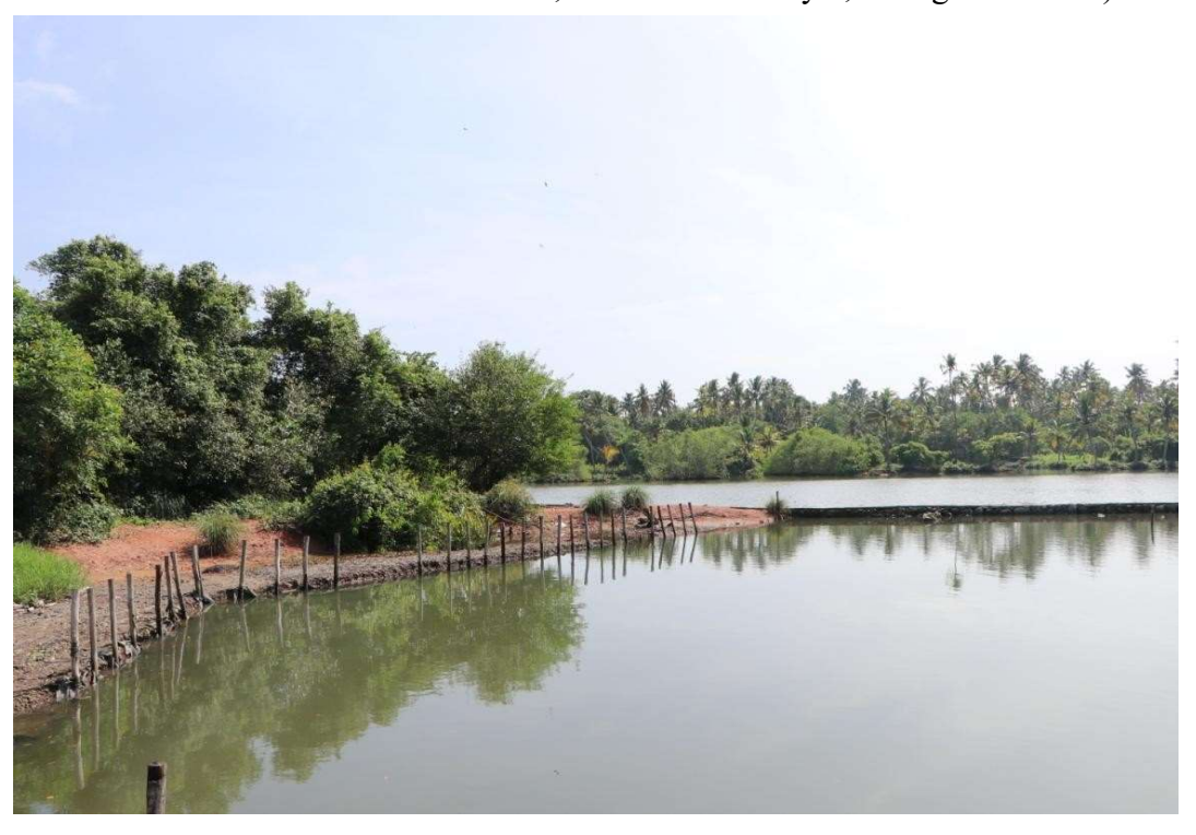
Plate-10: Mangroves area at Anchuthengue Kayal (Location: 76° 45' 6.93" E 8° 41' 0.99" N Anchuthengue Panchayat, Village: Anchuthengue