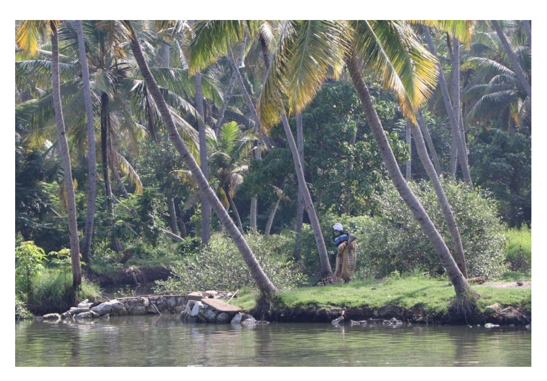
Plate-9: Mangrove patch at the banks of Anchuthengue Kayal (Location: 76° 45' 8.24" E 8° 41' 4.03" N, Vakkom Panchayat, Village: Vakkom)